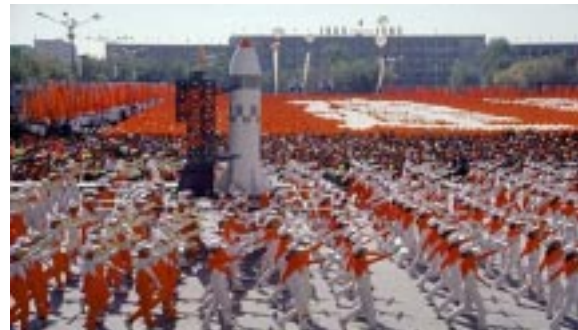
A Communist Parade

Third, they wanted to be the leader of the communist world by beating down the Soviet Union by export revolution into third world countries.