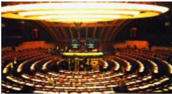
Council of Europe

The Council of Europe is in session four times a year. It is set up to defend the democracy and the Human Rights in the world. Every month political commissions meet to debate urgent matters. The Council of Europe is often underestimated. Though, during the plenary session in April 2000 for example the problems in Tchetcheny were discussed.