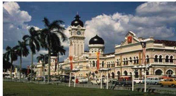
Malaysian Government Buildings

In Malaysia, old institutions are grappling to respond to political demands of a newly awakened society following the sacking of former deputy prime minister Anwar Ibrahim. The recently set up Human Rights Commission is seen as being caught in the old economy as its composition ignores some that have been actively being working in the field, and the range of rights issues that it is prepared to take up is unclear.