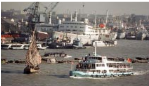
The port of Shanghai

From then, China sent thousands of officials and yang students to study modern technology in the West. Modern schools and industry were built up in China. Railways linked major cities and parts of China. Engineers, lecturers, and bankers became important social classes. Shanghai even developed into one of the biggest financial and commercial centres in the world during the 1930's. However, what China never adopted was the concept of rule of law, human rights and democracy. Chinese people have not had any kind of protection against powerful rulers. What was more, people even became the state's slaves under Mo's Communist regime.